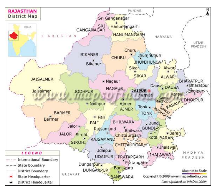
Annexure I -Location map of Sriganganagar